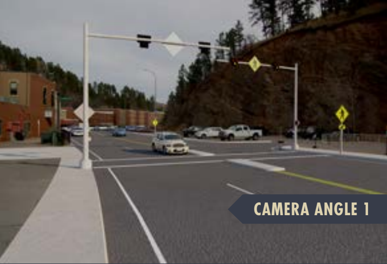
CAMERA ANGLE 1