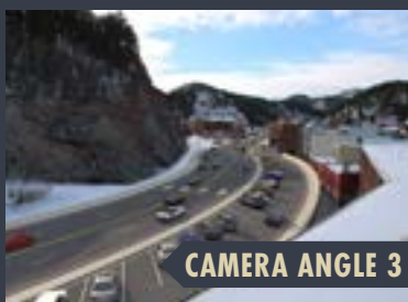
CAMERA ANGLE 3