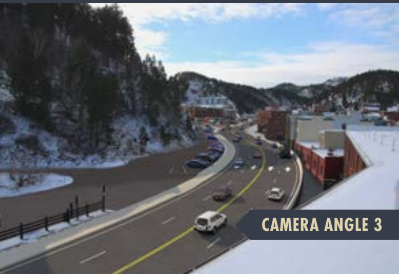
CAMERA ANGLE 3