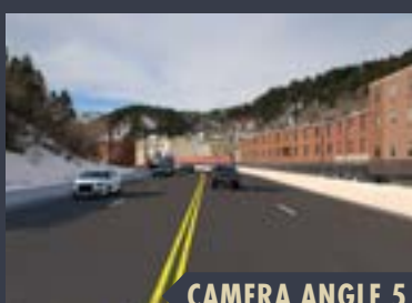
CAMERA ANGLE 5