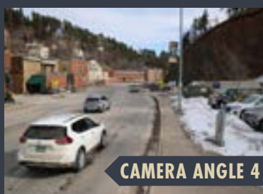
CAMERA ANGLE 4