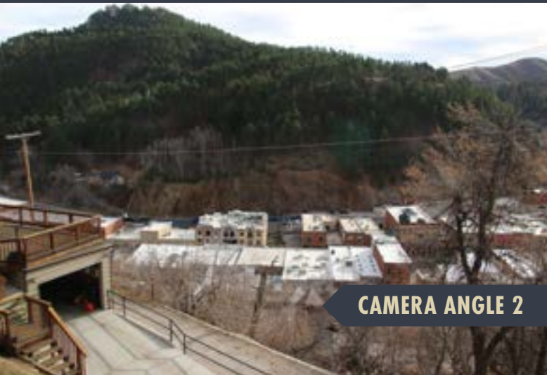
CAMERA ANGLE 2