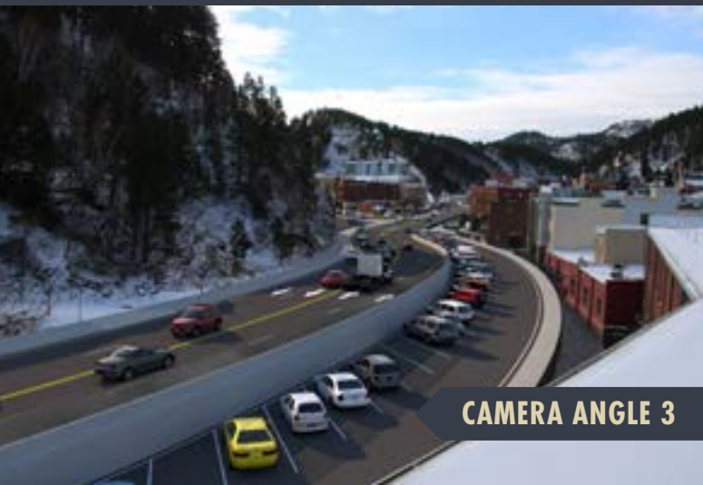
CAMERA ANGLE 3