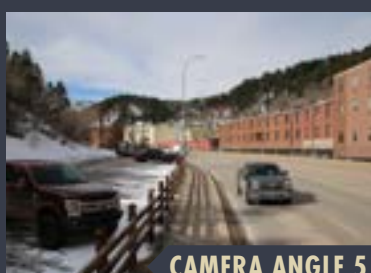
CAMERA ANGLE 5