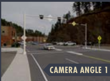
CAMERA ANGLE 1