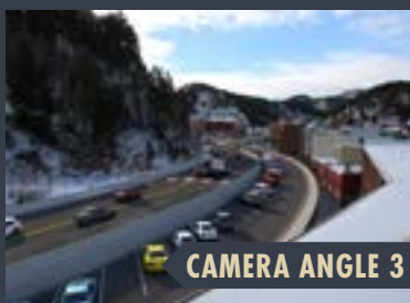
CAMERA ANGLE 3