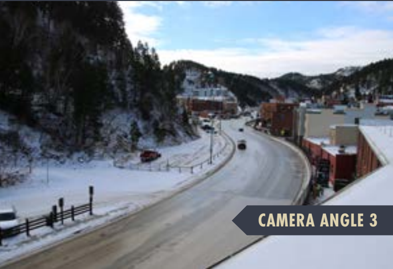
CAMERA ANGLE 3