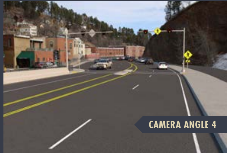
CAMERA ANGLE 4