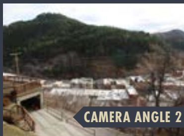
CAMERA ANGLE 2