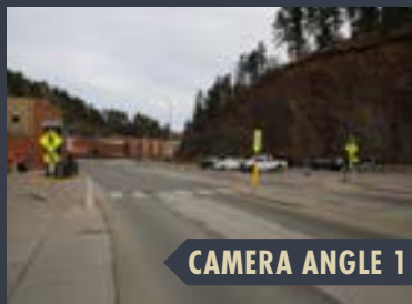
CAMERA ANGLE 1