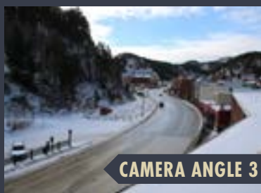
CAMERA ANGLE 3