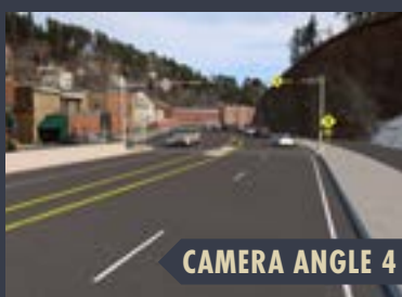
CAMERA ANGLE 4