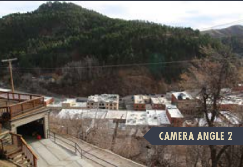
CAMERA ANGLE 2