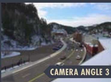
CAMERA ANGLE 3