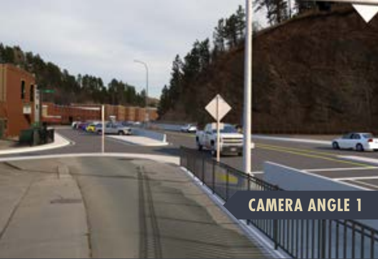
CAMERA ANGLE 1