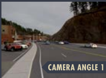
CAMERA ANGLE 1