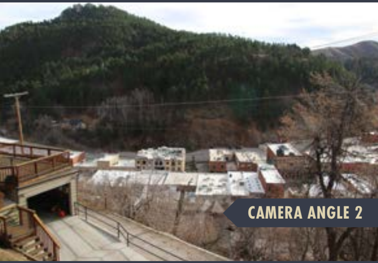
CAMERA ANGLE 2