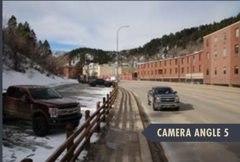
CAMERA ANGLE 5