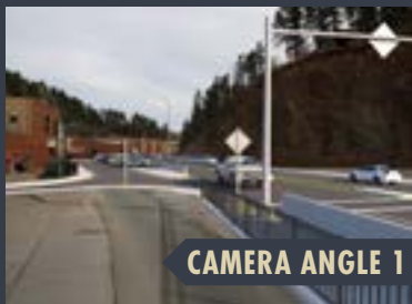
CAMERA ANGLE 1