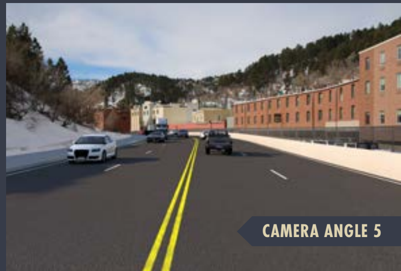
CAMERA ANGLE 5