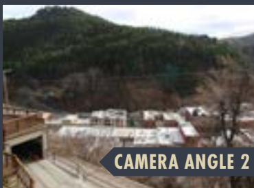
CAMERA ANGLE 2