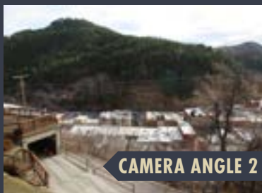
CAMERA ANGLE 2