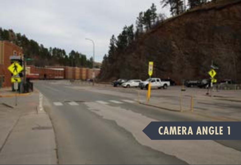
CAMERA ANGLE 1