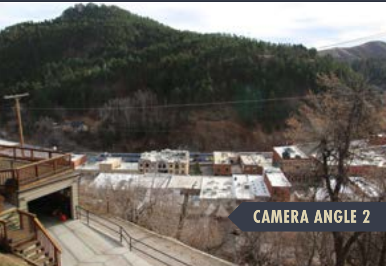
CAMERA ANGLE 2