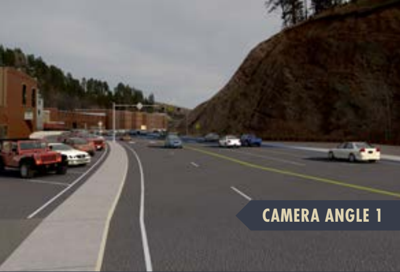
CAMERA ANGLE 1